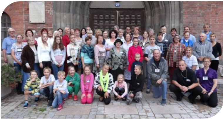
English Friendship Language Camp teachers and students in front of St. Paul's Lutheran Church in Tartu. August 20 th , 2014.

Cast all your anxiety on Him because He cares for you.