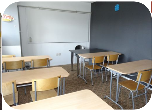
Two pictures of the current facilities of TAT.