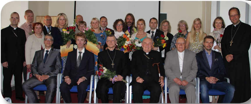
17 students graduated on June 17, 2016.