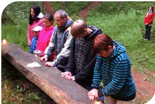
Holy Communion in Forest Church at TAT's summer camp, June 6 th , 2014.

To you, O Lord, I lift up my soul. O my God, in you I trust; do not let me be put to shame.